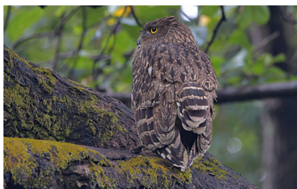
Brown Fish Owl